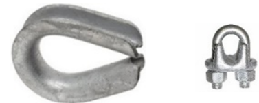
Thimbles and wire rope clips are available for added termination strength