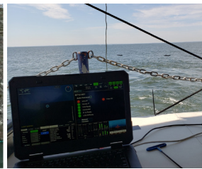
Mobile Command Center (MCC)