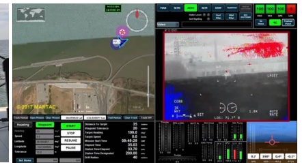
Real time video

Operate it from anywhere - Shore, shipboard, or riverine craft