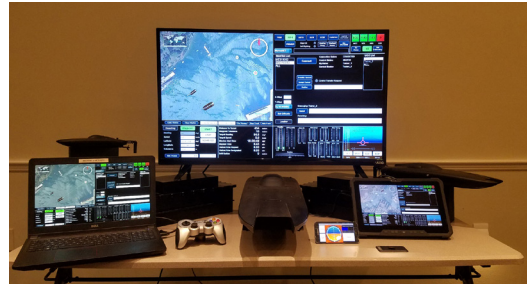
TASKER Control System